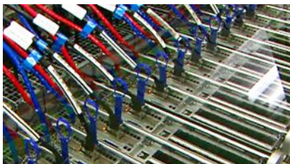
TSUBAME-KFC supercomputer ranked No.1 in the world in two consecutive editions of the energy efficiency "Green500 List"