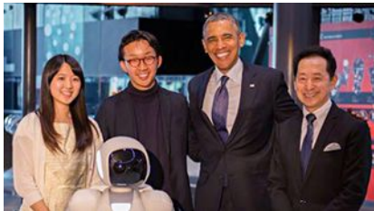
Tokyo Tech Students Meet President Obama