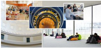
Reports on Visits Abroad: Tokyo Tech's Education Reform Efforts