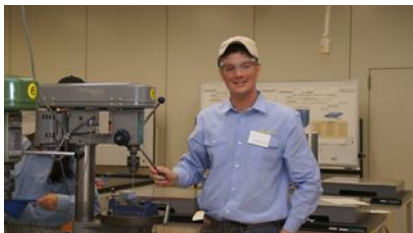
From Brazil to Japan - Beginning Studies and Making Friends at Tokyo Tech