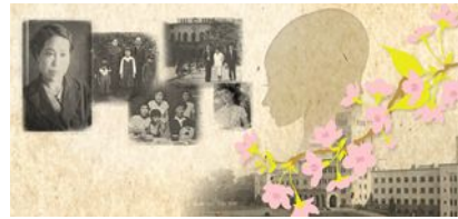
Rikejo: Japan's Pioneering Women in Science